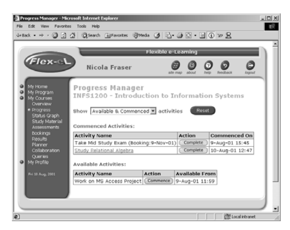
Figure 3. Flex-eL Progress Manager

fellows, the workload is also reduced because assessment and consultations times can be booked prior to the actual meeting. Overall, the learning and teaching effectiveness of courses is enhanced due to the efficient and flexible time management.